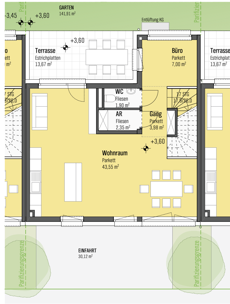
EG M 1:100