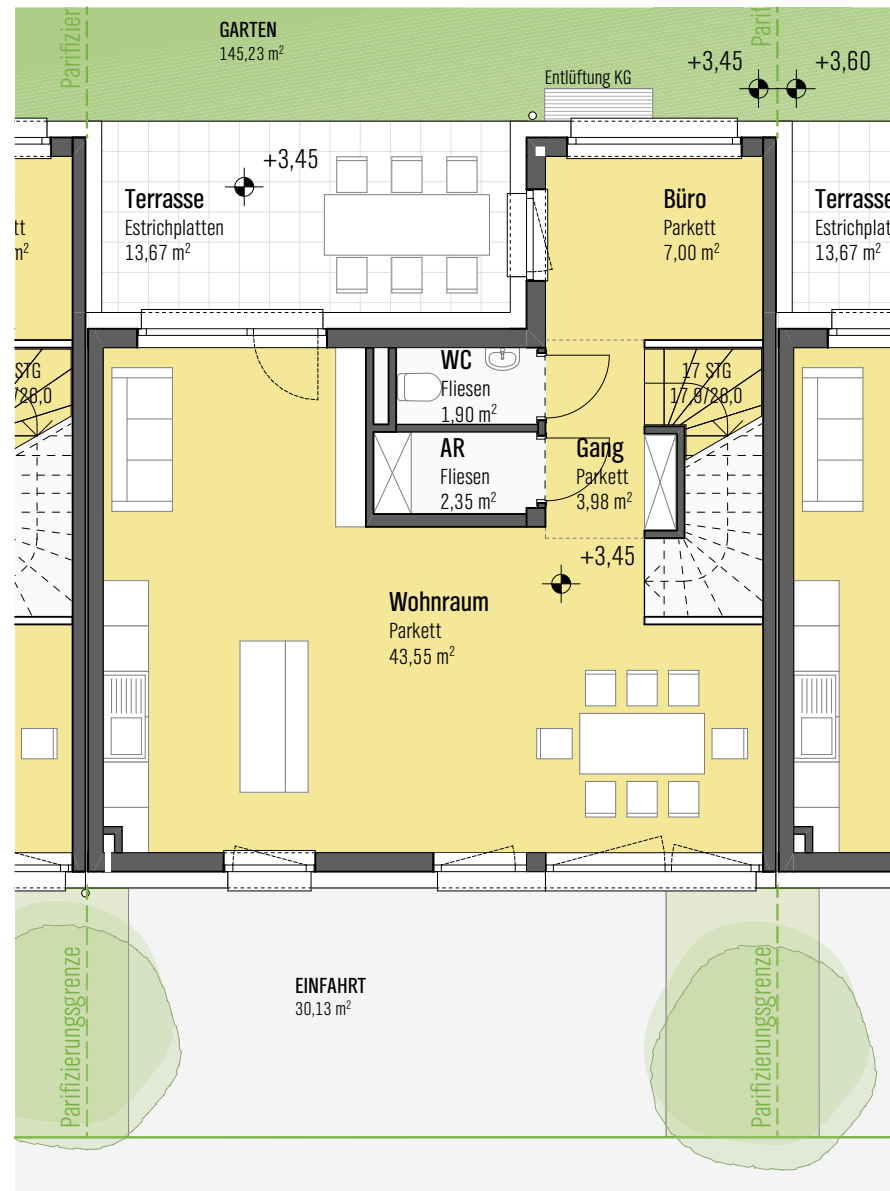
EG M 1:100